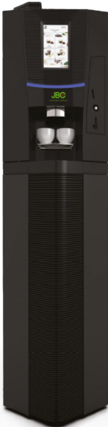
JBC 350 TOUCH 7" + BLACK CABINET