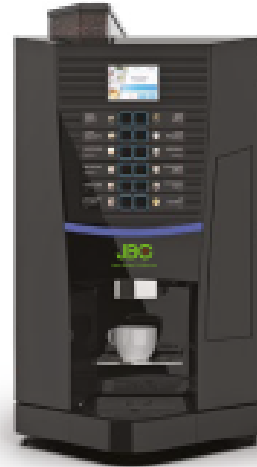
JBC 350 EASY + FRESH MILK MODULE (optional accessory)

JBC350, the semi-automatic solution to create a complete and efficient coffee area with a design capable of enhancing any environment.